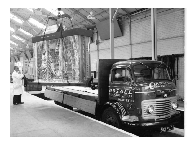
The central processor bay on its way from the Ferranti factory to The University of Manchester in June 1961.